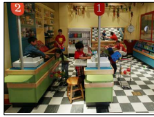
Styles of Play Cooperative Play