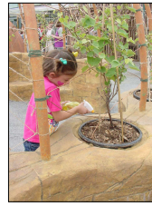
Styles of Play Solitary Independent Play