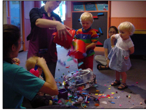
Styles of Play Onlooker Play