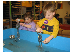
Styles of Play Parallel Play